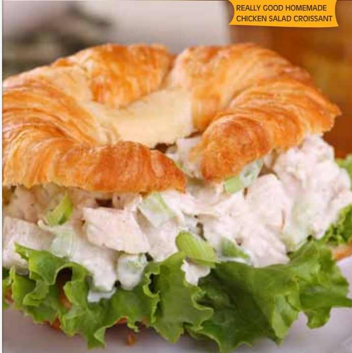
REALLY GOOD HOMEMADE CHICKEN SALAD CROISSANT