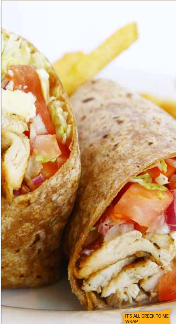
IT'S ALL GREEK TO ME WRAP