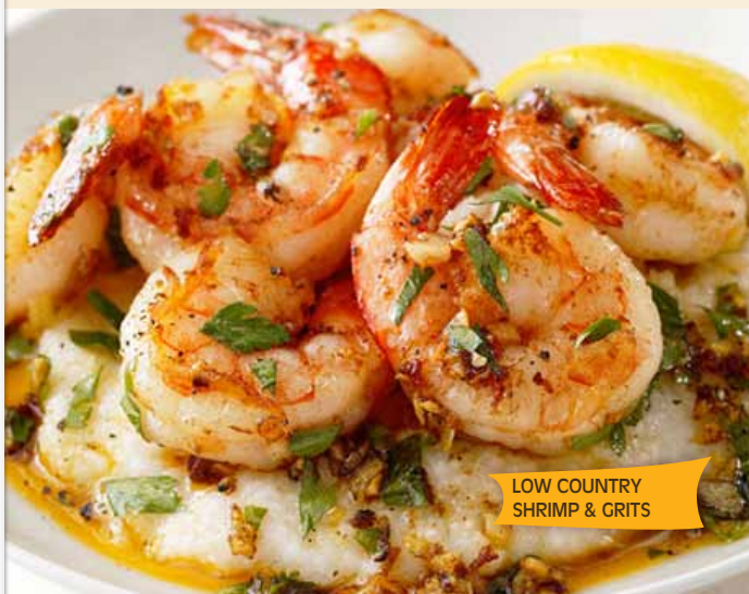
LOW COUNTRY SHRIMP & GRITS

Sautéed chicken with artichokes, crispy prosciutto, capers and mushrooms in a white wine sauce over angel hair pasta.