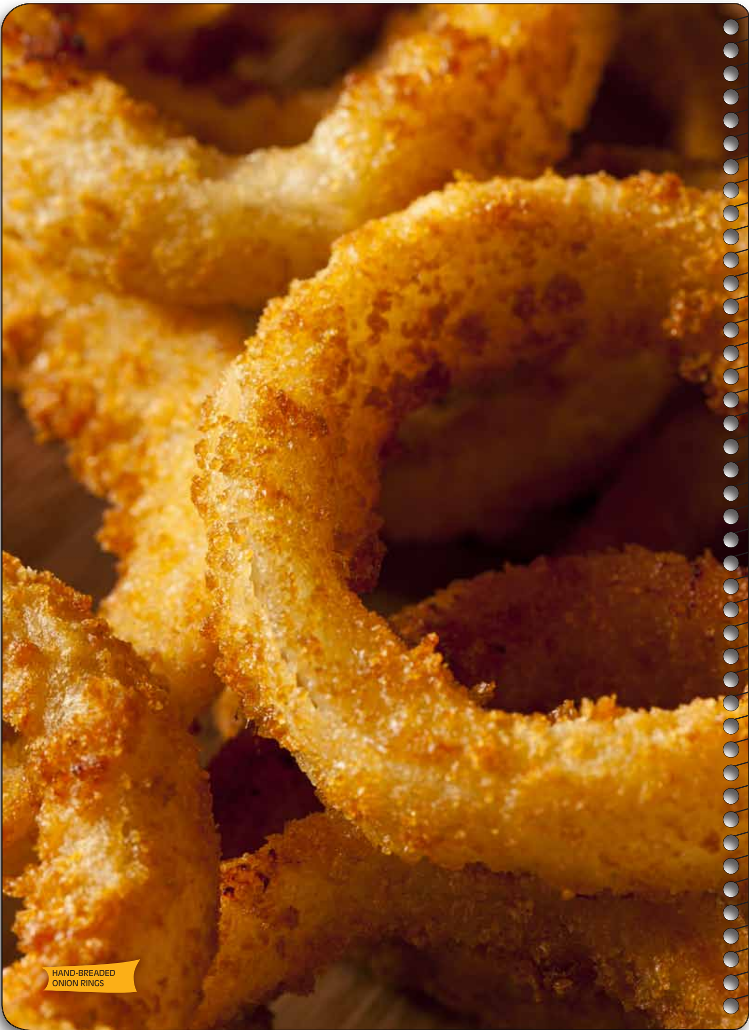
HAND-BREADED ONION RINGS