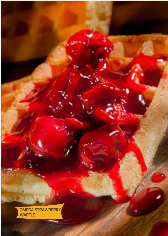
OMEGA STRAWBERRY WAFFLE