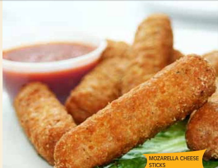
MOZZARELLA CHEESE STICKS

A bowl of our delicious homemade soup of the day and a fresh, crisp salad with your choice of dressing.