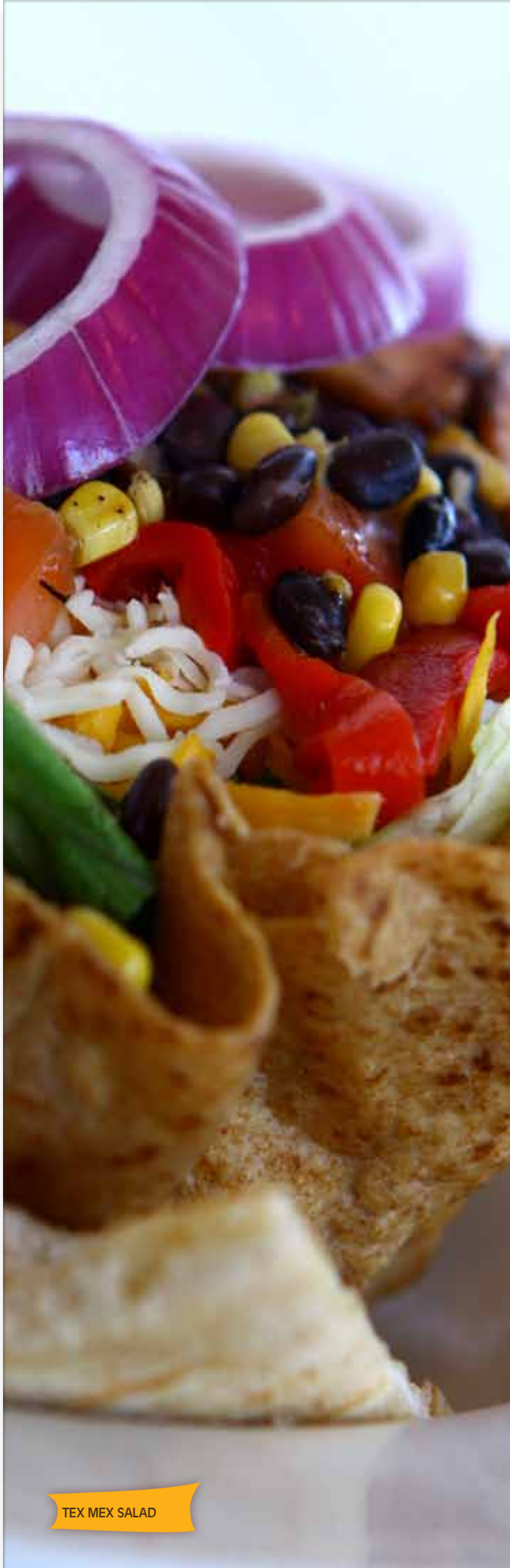
TEX MEX SALAD