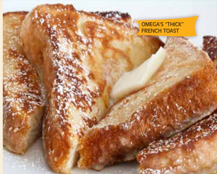
OMEGA'S "THICK" FRENCH TOAST