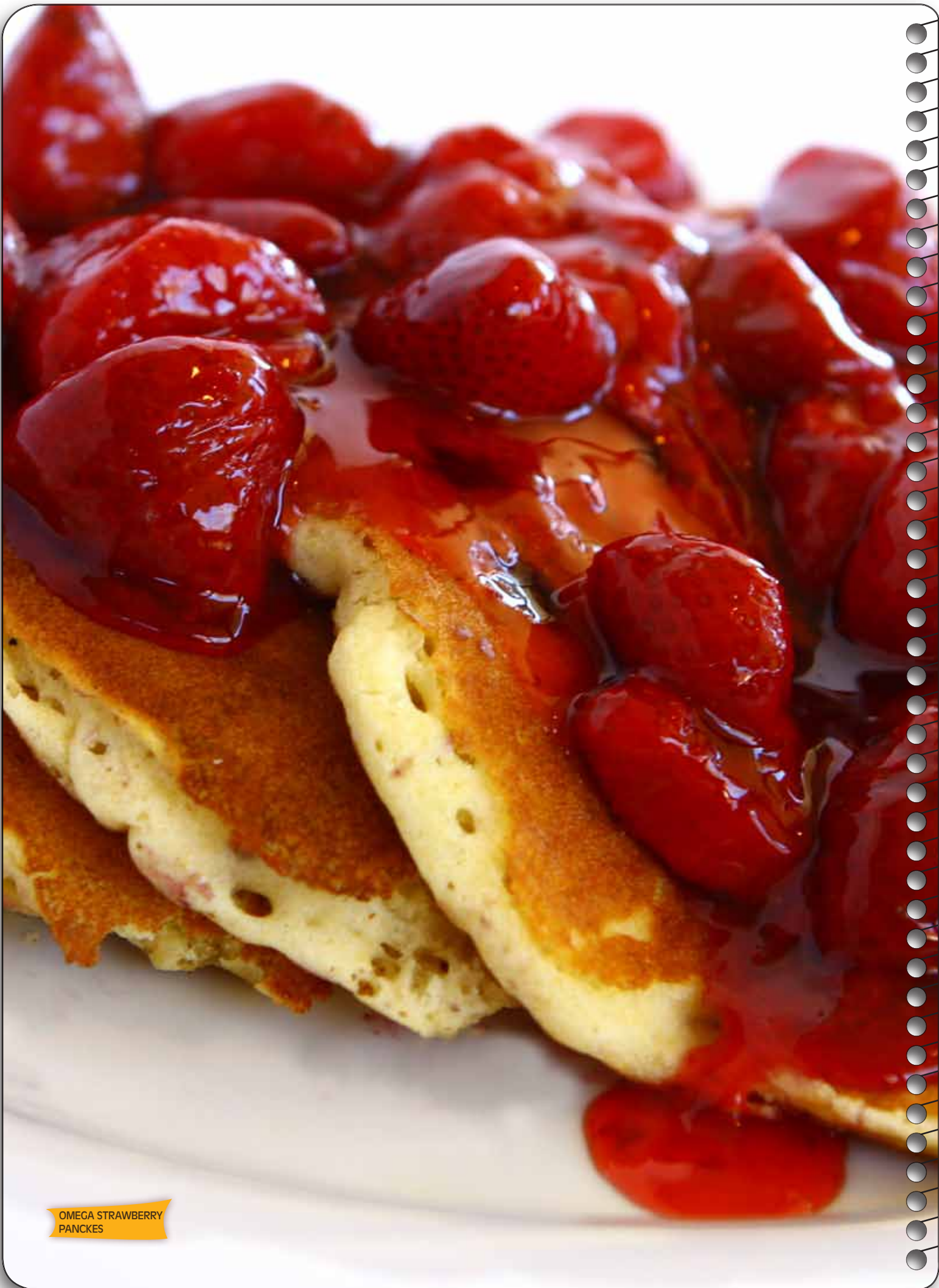
OMEGA STRAWBERRY PANCKES