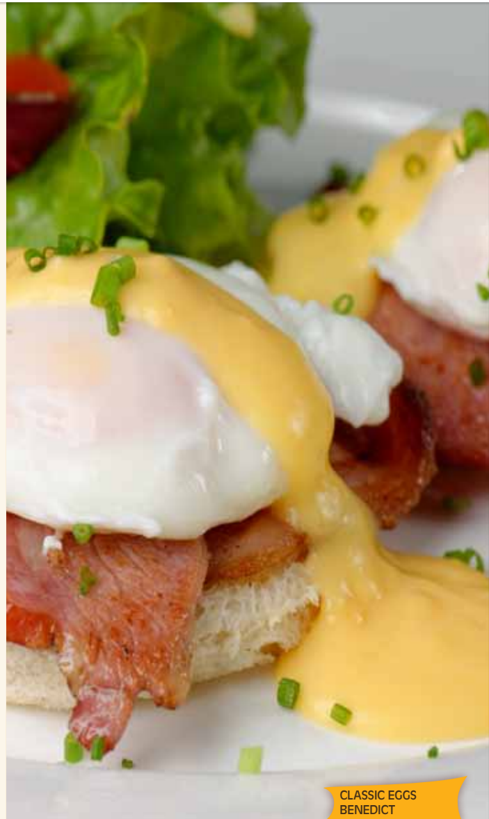
CLASSIC EGGS BENEDICT

Egg whites, sliced turkey breast, fresh baby spinach, mushrooms, tomatoes and onions