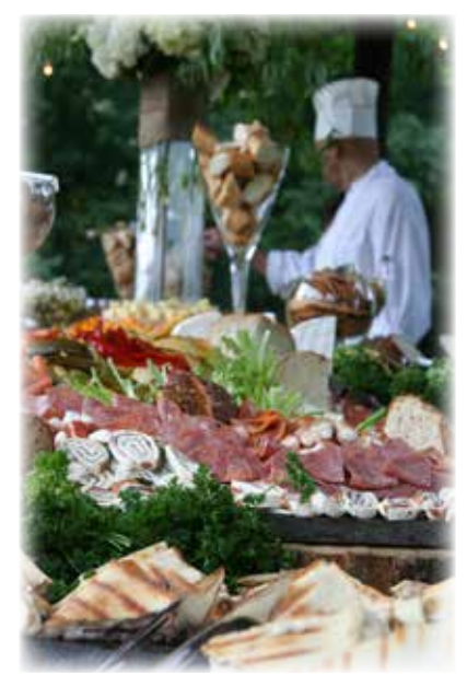
*CONSUMING RAW OR UNDERCOOKED MEATS, POULTRY, SEAFOOD, SHELLFISH OR EGGS MAY INCREASE YOUR RISK OF FOODBORNE ILLNESS.